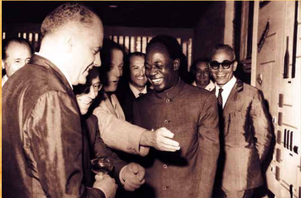
Osagyefo being conducted around the refinery facilities